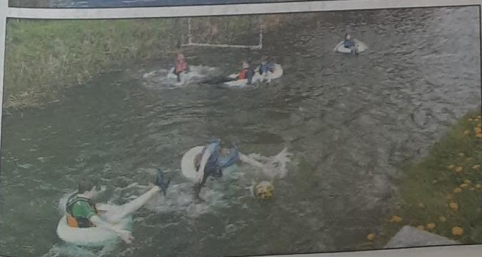
ABOVE: The gathering at the canal.