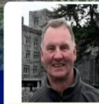
10km Walter Broderick K2 Trophy