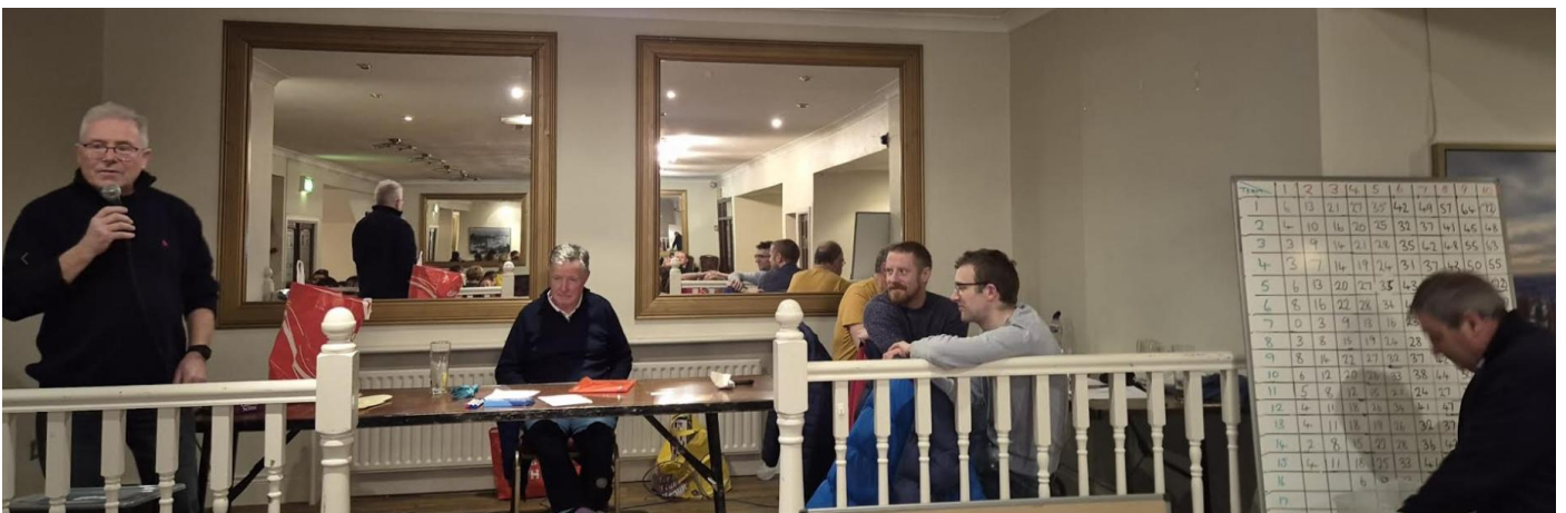
The Quiz Masters at Work